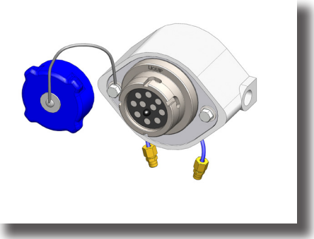
ITP104 model with 5069 truck plug cover shown.

The ITP100 series of truck plugs features a stainless steel nose ring and J-slots for longer service life and incorporates an air interlock switch which is activated when the gantry plug is connected. This can be used to operate several other pneumatic devices to prevent loading or damage from tanker driveaways.