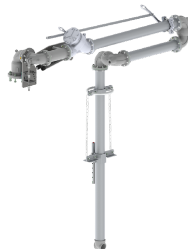
Pantograph Loading Arm

Liquip specialise in offering balanced pantograph arms for superior strength and stability. Pantograph arms are a simple and affordable design for medium duty applications.